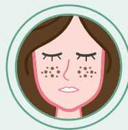
BENIGN PIGMENTED LESIONS