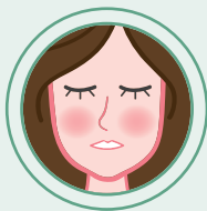
BENIGN VASCULAR LESIONS

It will be possible to observe a smoother skin with gradual wrinkles flattening and progressive fade of superficial blood vessels and brown spots.